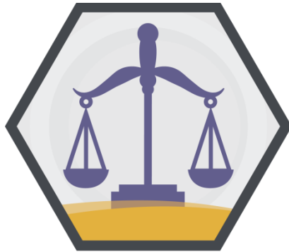
Ethics & Transparency