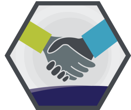
Collaboration & Partnerships