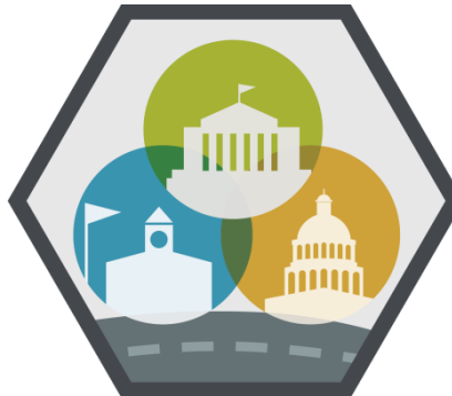
Cities Counties Schools Partnership