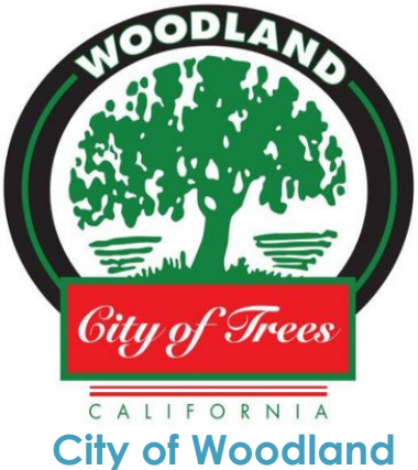
City of Woodland